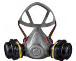
AVIVA HALF MASK

SUPPORTED BY SURELIFE CARTRIDGE CALCULATOR Available at www.ScottSureLife.com