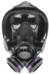
AV-3000 WITH SURESEAL