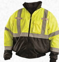
2-IN-1 BLK BTTM BOMBER LUX-350-JB-B