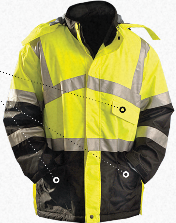
INSULATED BLACK BOTTOM PARKA LUX-TJCW

1 left chest pocket 2 lower front pockets