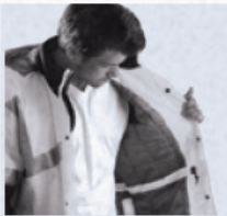
Thermal insulation with side-snapped opening.

The thermometer shows the ANSI tested, ASTM F2732, temperature range for garments. Whether you are standing out in the elements in between tasks or hard at work, we have the right gear for your winter.