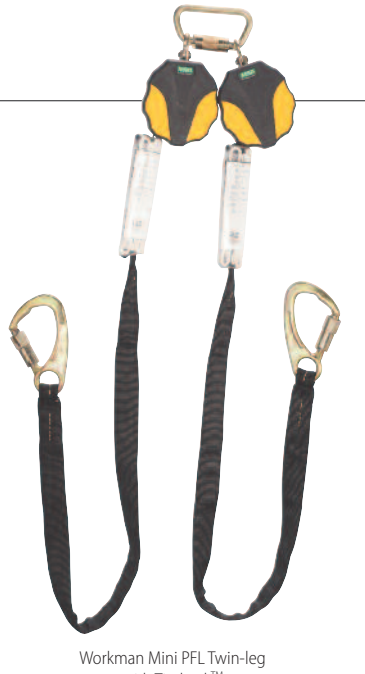
with Tie-back<sup>TM</sup> Part No. 10157864