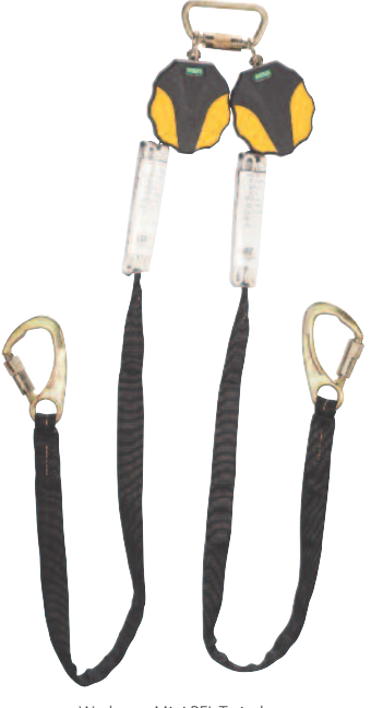
Workman Mini PFL Twin-leg with Tie-back<sup>TM</sup> Part No. 10157864