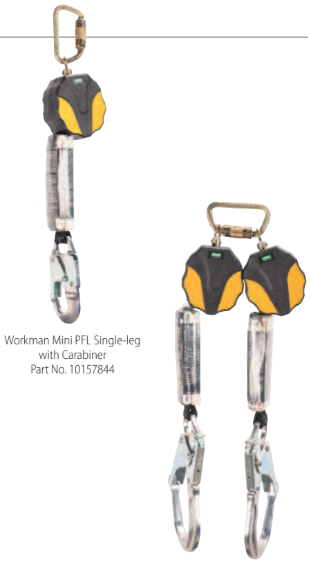
Workman Mini PFL Twin-leg with Carabiner Part No. 10157862