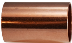
COUPLING (SOCKET) LESS TUBE STOP C X C