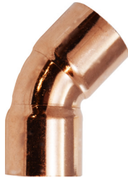
45° ELL C X C