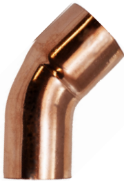
STREET 45° FTG. X C