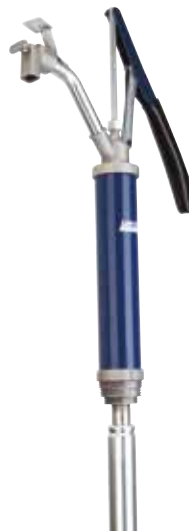
Model 1340 lever-action barrel pump