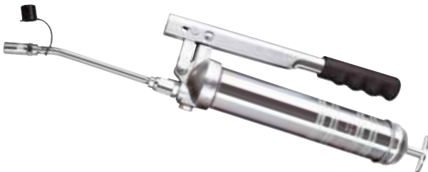
Model 1013 heavy-duty lever-action grease gun