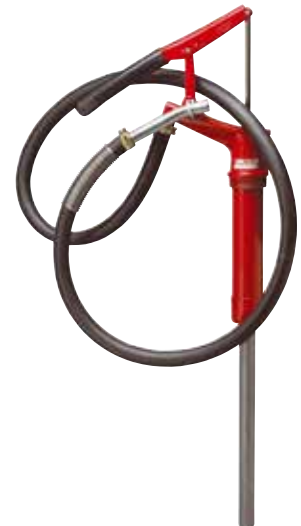
Model 1335 manual transfer pump