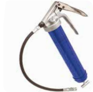
Model 1134 heavy-duty pistol grip grease gun