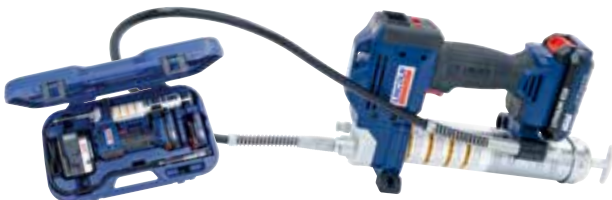
Model 1884 20 V Li-ion PowerLuber, 2 battery