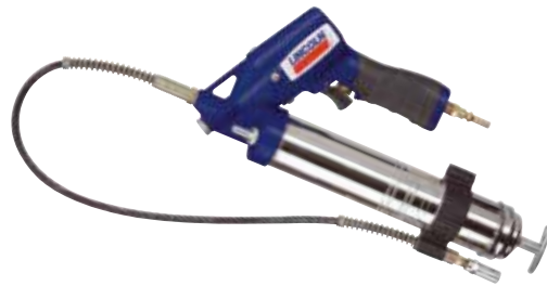
Model 1162 air-operated grease gun