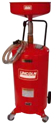
Model 3601 fluid drain, 18 gal.