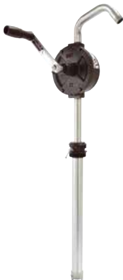
Model 1385 rotary drum pump