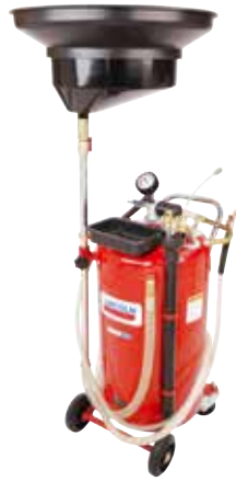
Model 3639 fluid drain and evacuator, 25 gal.