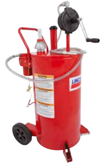
Model 3677 fuel caddy with filter, 25 gal.