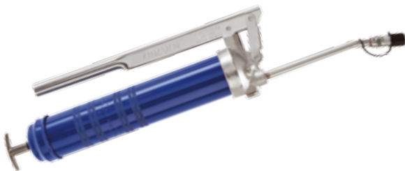
Model 1142 lever-action grease gun