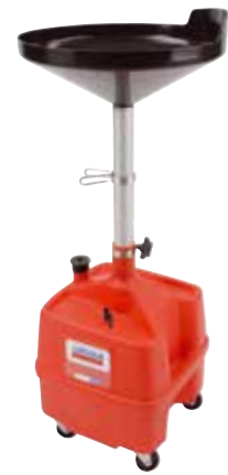
Model 3508 fluid drain, 8 gal.