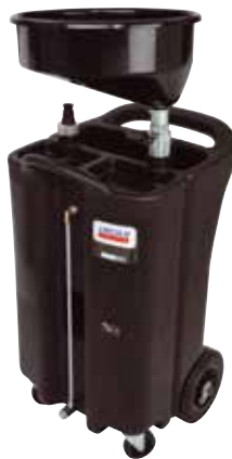
Model 3669 low-profile fluid drain with electric pump, 17 gal.