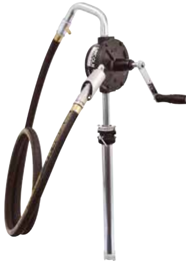
Model 1387 rotary drum pump for fuel