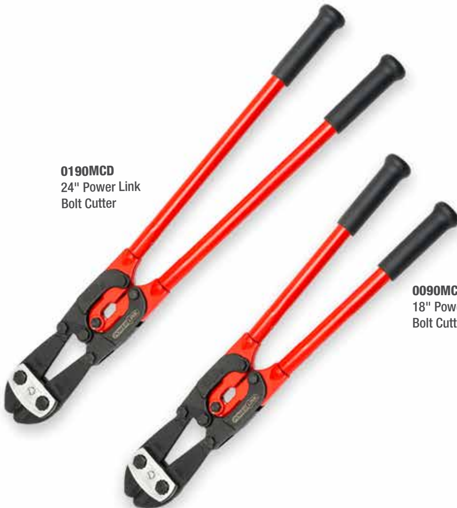
0090MCD 18" Power Link Bolt Cutter