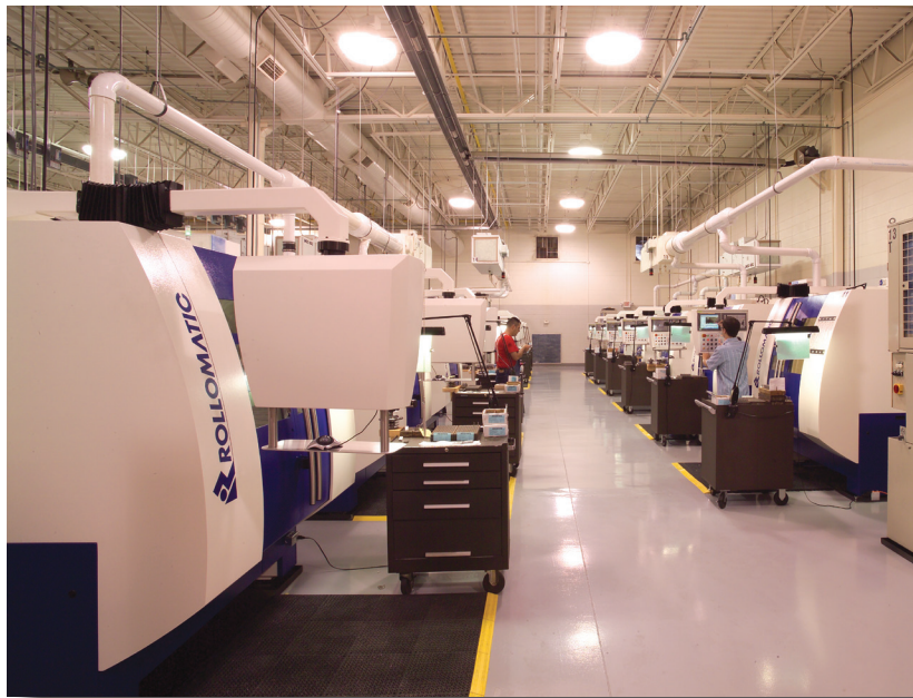
End Mill Manufacturing