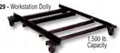
1,500 lb. Capacity