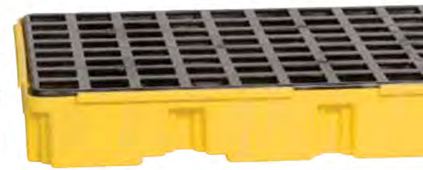
Convenient Storage Center

Modular design allows for multiple configurations. Easy to connect with built-in U-channel. Low profile for easy loading and unloading