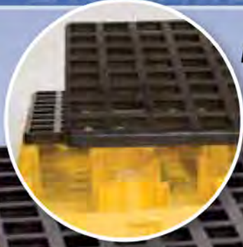
Easily removable grating for cleaning