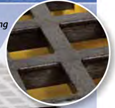
Flat top grating