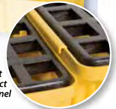
Modular pallet easy to connect with built in u-channel