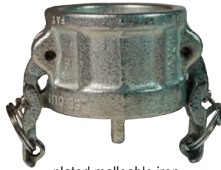
plated malleable iron