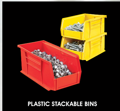
PLASTIC STACKABLE BINS