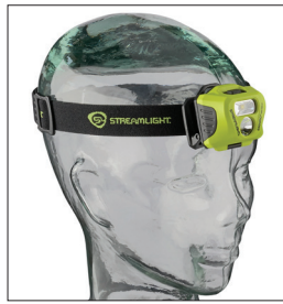
Lightweight, low-profile design