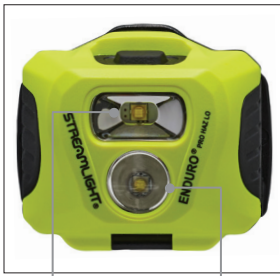
Flood LED Spot LED

Uses 3 "AAA" alkaline batteries (included)