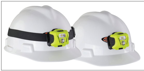
Includes rubber strap and 3M® Dual Lock® for strapless mounting to hard hats