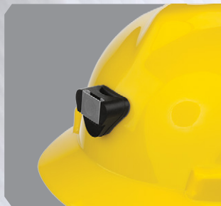
Fits most hard hats