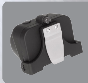
Integrated stainless steel clip