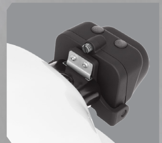
Tool-less secure pressure fit mounting