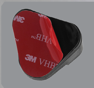
Industrial strength PSA backing