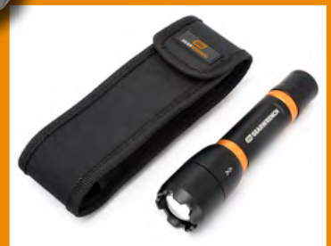
83123P - Flashlight Holster specifically for 83123